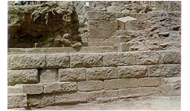
Starosel Temple-Tomb. The earth of the tumulus is still in front of the entry. August 2000.