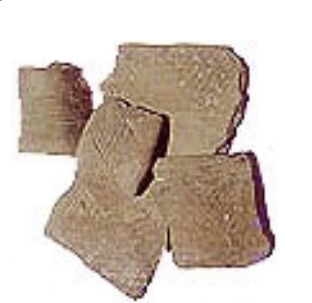
Encrusted and corded pottery from phase IIB2.

The Early Bronze Age Village centre of Dubene-Sarovka in the for-Sushtinska Sredna Gora Mountains (Karlovo Municipality)