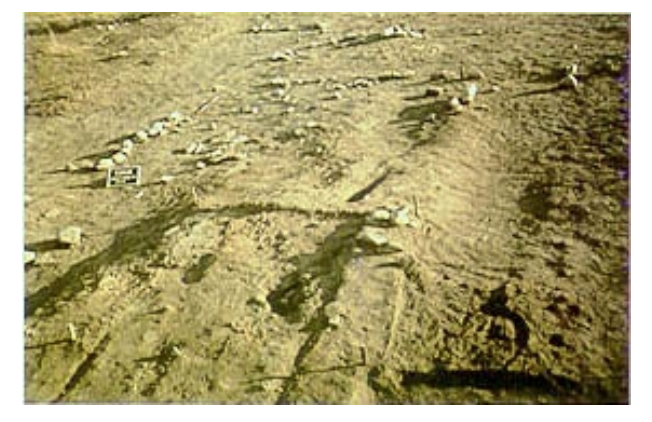
Dubene-Sarovka. July 2000. Full investigation of Apses-House No. 1.

Welcome to see something really interesting!