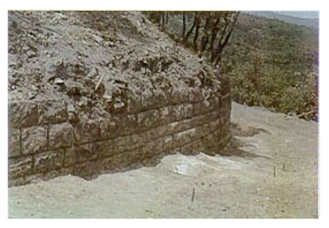
Starosel Temple-Tomb, August 2000