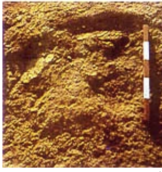
A pithos from Dubene-Sarovka IIB2.

Encrusted pottery from Dubene-Sarovka. Dubene-Sarovaka, the Early Bronze IIB. Yunasite II culture. biggest Early Bronze