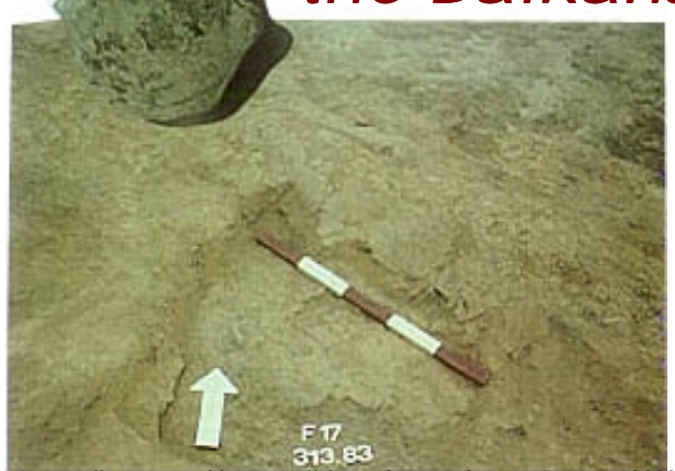
A partially preserved house wall from phase IIB2. Excavations in 2000

Ancient Secrets Unearthed in the Heart of the Balkans