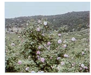
Karlovo Vallev of the Roses