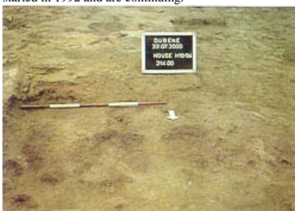
Dubene-Sarovka IIB. A burnt house floor.