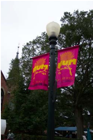
This year marked CIM's eighth consecutive year evangelistically participating in the Chrysanthemum Festival— Praise Jesus!