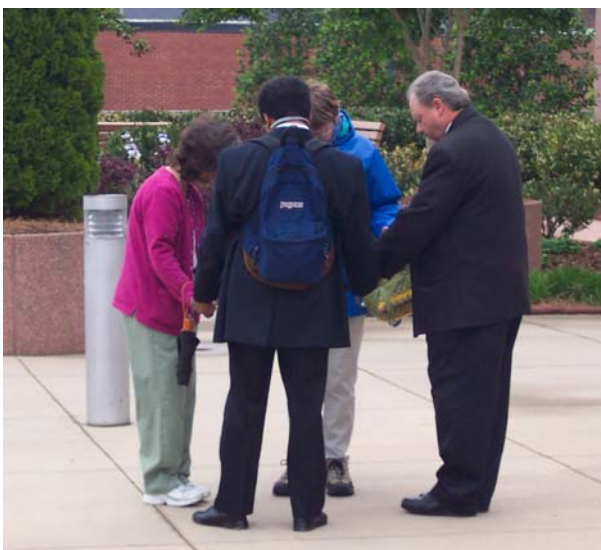
Attendees broke in small groups for personal and corporate prayer for families, our government, our nation and our world today!