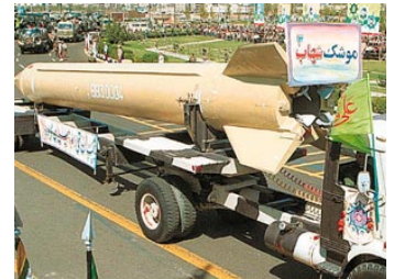
An Iranian Shihab-3 missile, capable of striking Israel with a nuclear warhead, is regularly paraded in Teheran.