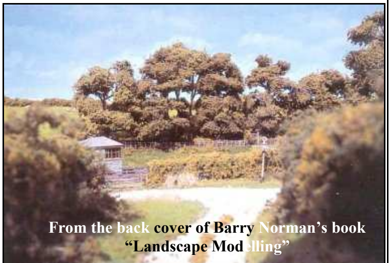
From the back cover of Barry Norman's book " Landscape Modelling "