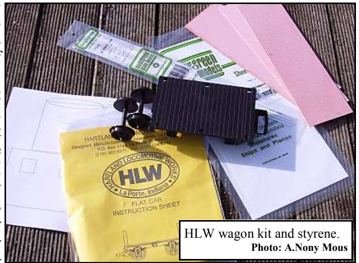
HLW wagon kit and styrene.

a bottle. This was fastened in place with MEK. The chimney is a length of 6mm styrene rod. The model was painted with Badger acrylic paint.