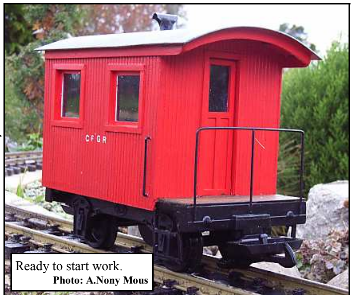
Ready to start work.