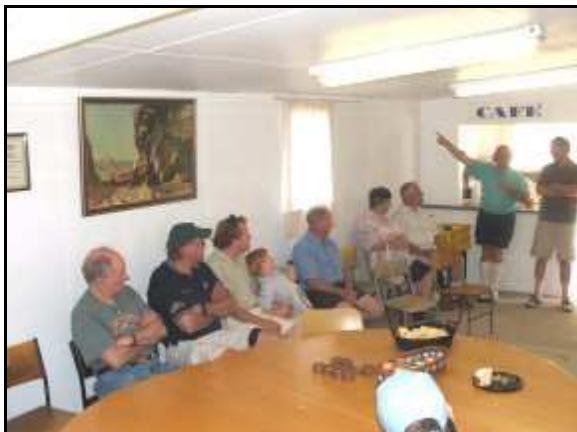
Our visitors receiving instructions on how the tour will be conducted.