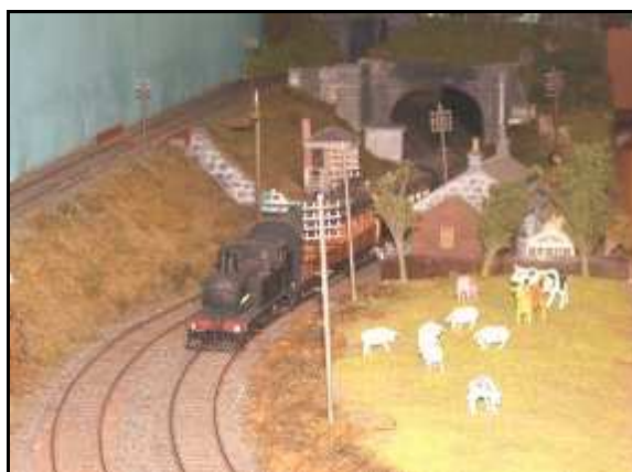
Great North of Scotland Tank loco & train on George Watt's 7mm layout