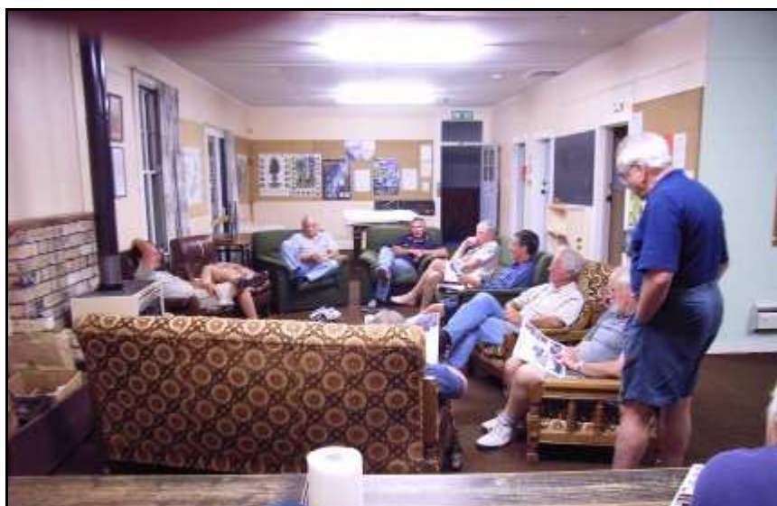
Pokaka, Saturday 4 February 2006. So quiet one could almost hear a pin drop.