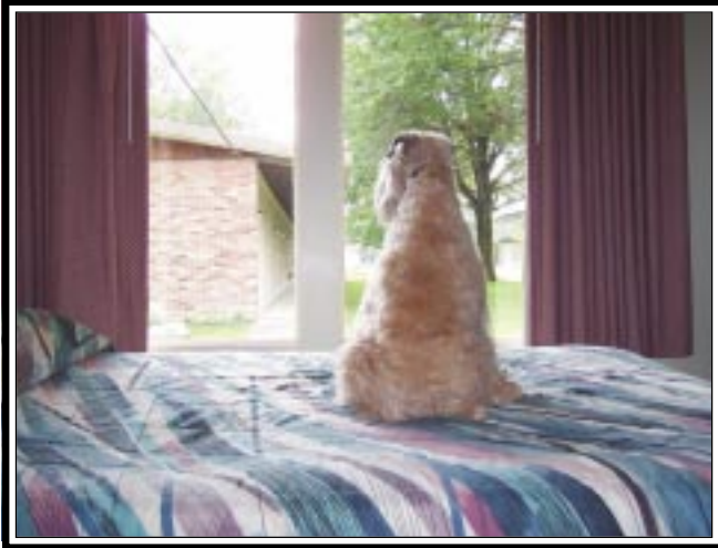
My main duty on the trip was to protect motel rooms from strangers and strange noises. I had similar duties while in the van.