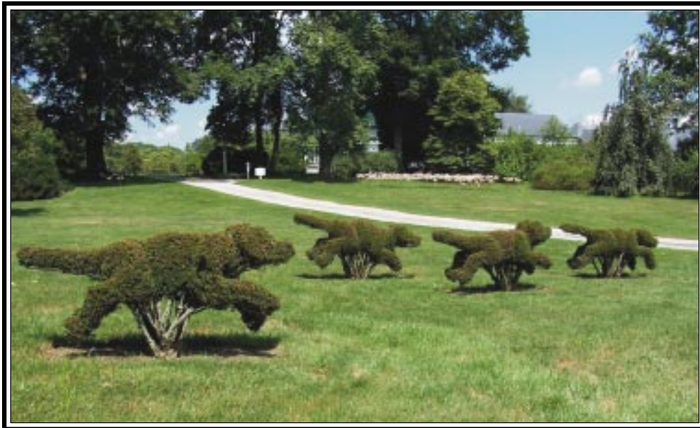
Dog topiaries at Ladew Topiary Gardens near Monkton, Maryland.

Mix cheese, oil, and applesauce. Add veggies, garlic, and flour. Combine thoroughly. Add just enough milk to form a ball (about ½ cup). Cover and chill for half an hour. Roll onto floured surface to ¼ inch thick. Cut into shapes. Bake at 375° on greased baking sheet for 20 minutes or until golden brown. Cool on racks. Store in a covered container in the refrigerator or freezer.