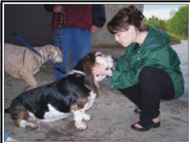
I am so sad .... there is no consoling me.