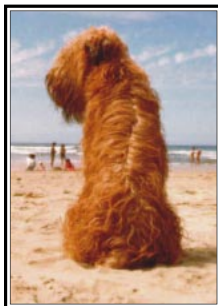
A spontaneous photo of BJ after a romp in the waves on the Oregon Coast in 1981.