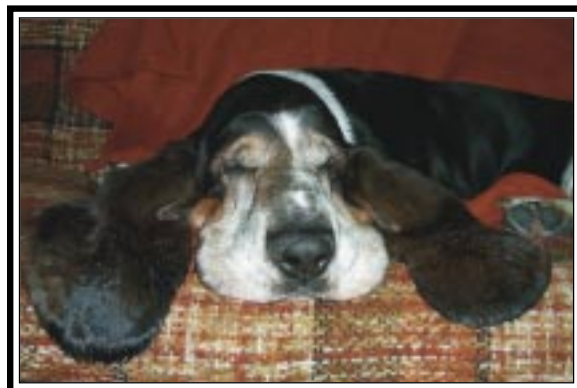
MacDuff, taken with the camera at eye level. A sleeping dog makes a perfect subject.

An assistant can be helpful for holding an enticing treat or for making a shrill noise to get your dog's attention, to perk up his ears, or tilt his head to the side.