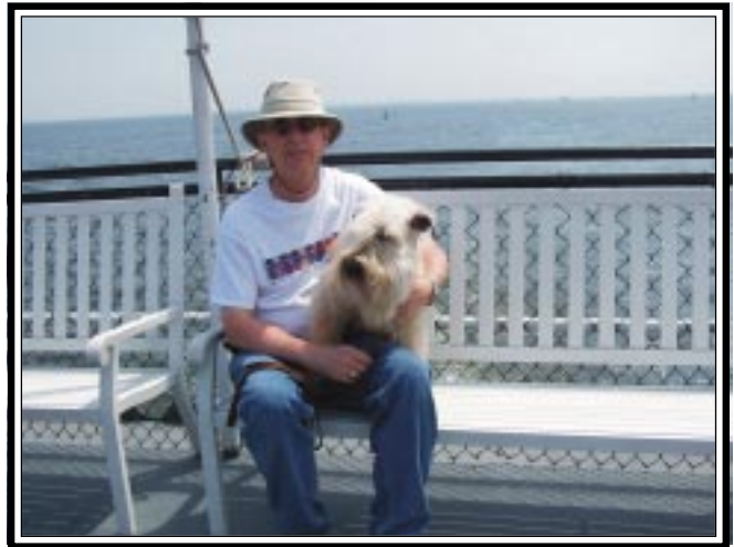
In Annapolis, Maryland we went out on Chesapeake Bay on The Harbor Queen. I got to sail free of charge.