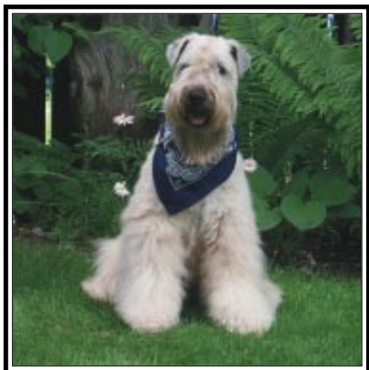
A posed photo of Max taken in our backyard.

Send your photos to the editor of The Prairie Wheaten for publication in future issues.