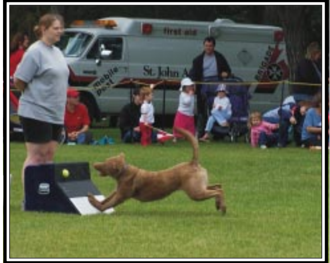
The exciting sport of Flyball was demonstrated by Regina's Kaos Dogsports members to a crowd of enthusiastic spectators as part of the Canada Day activities in Wascana Park on July 1, 2004.