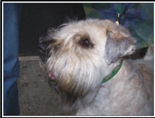
Can't we just go for a "little" walk?

On June 6th, 2004, 10 people, 11 Wheatens, 1 Jack Russell Terrier and 1 Basset Hound gathered for our Spring Walk. The heavens opened and the rain poured down. It was our first ever rained out walk. Here is the group gathered under an overhang of the parkade keeping dry while visiting. The disappointed dogs had a few thoughts about this sad turn of events: