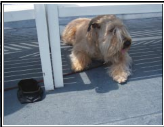
The nice girl at the bar filled my portable dish with water for me. When the boat started to toss on the waves it made me feel a little unsteady on my feet. This was the best place for me to be.