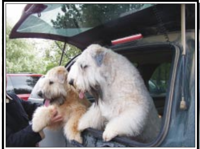
C'mon, we really, really, really want to walk.