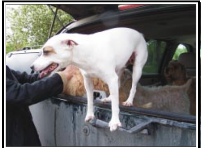
Let me walk or I'll jump!