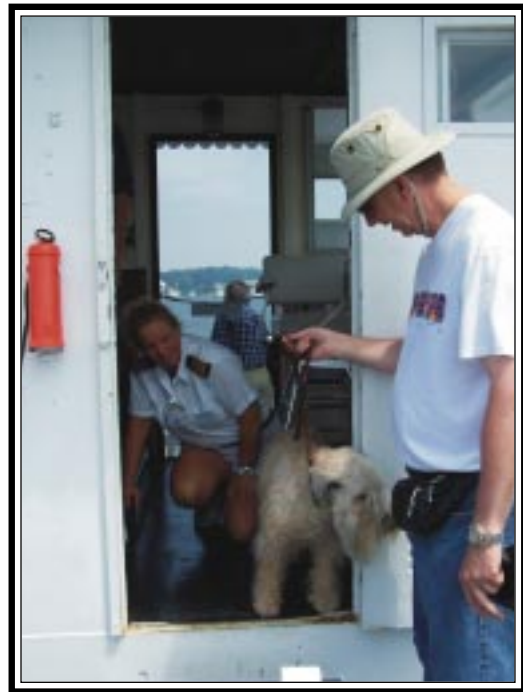
The crew of The Harbor Queen invited me into the wheel house for a visit. After the boat ride we shopped in Annapolis. Many stores love dogs so much that they put dishes of water and treats near their front doors.