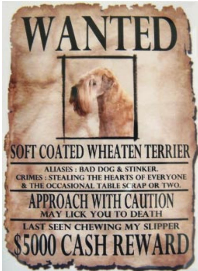
This Soft Coated Wheaten Terrier "Wanted" poster is an enlarged photo of a refrigerator magnet purchased on e-Bay.

Dog owners see doctors twenty percent fewer times than dogless people. Take two puppies and call me in the morning!