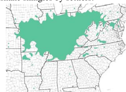
Plant illustration by Jenny M. Lyverse, from Landscape Plants for Eastern North America, 2nd Edition , Harrison L. Flint Author. Range map modified from UConn Plant Database. www.hort.uconn.edu/plants/q/queimb/queimb1.html

Shingle oak is a medium to large tree with a mature height of 50 to 80 feet and a equal spread. Appropriate for a medium to large yard or park, this tree will reward the grower with shade. It grows best in moist, deep, well drained, acid soils with full sun, but has tolerance for dryer soils and urban conditions. The unlobed, lance-like leaves are lustrous dark green turning tan in the fall and staying attached through most of the winter. Transplanting is easier than most oaks. I have not seen it in SW Missouri. - plantings would be unique in our landscape. The name comes from the wood being used as shake shingles by settlers.