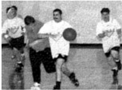
The Thunderbolts put on some speed.