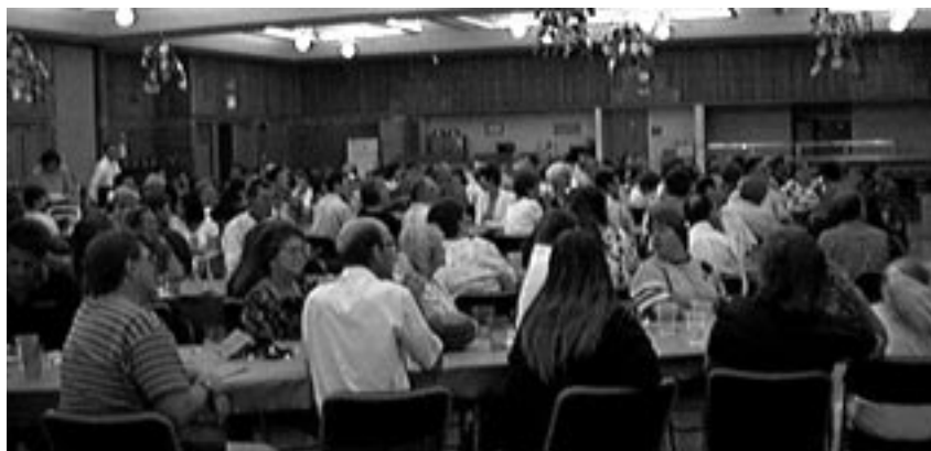
The banquet attendees watch as athletes receive well-deserved awards.