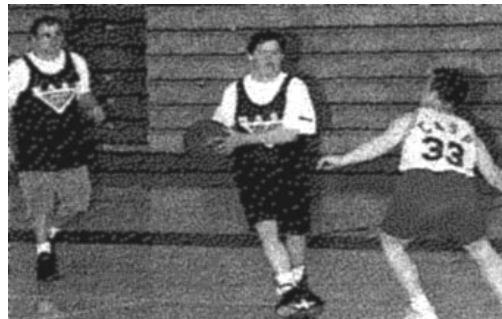
Mesa II show their hustle.

MASD II fought harder than ever against tough and physical competition in the State Tournament. They really hustled and got off a lot of shots. Unfortunately, many of them didn't go in. But the attempts, along with great passing and rebounding, are encouraging signs for a good season next year. Keep practicing!