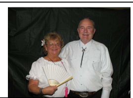
Flash Back Pictures from 2006