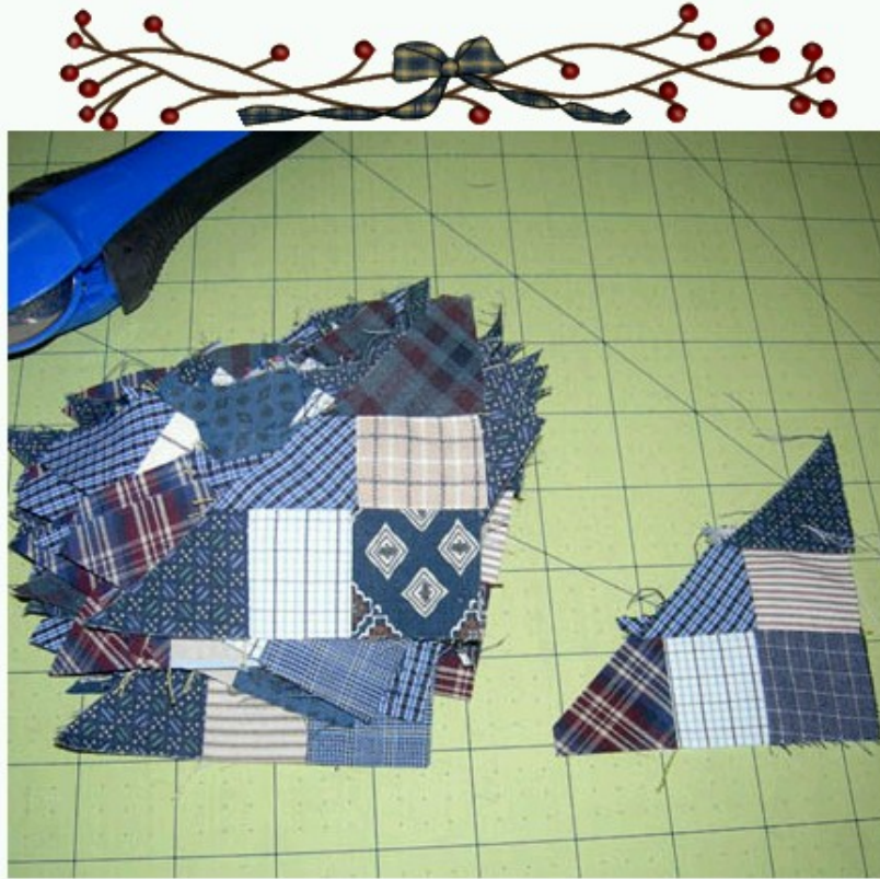
Little Pieced Triangles! :cP