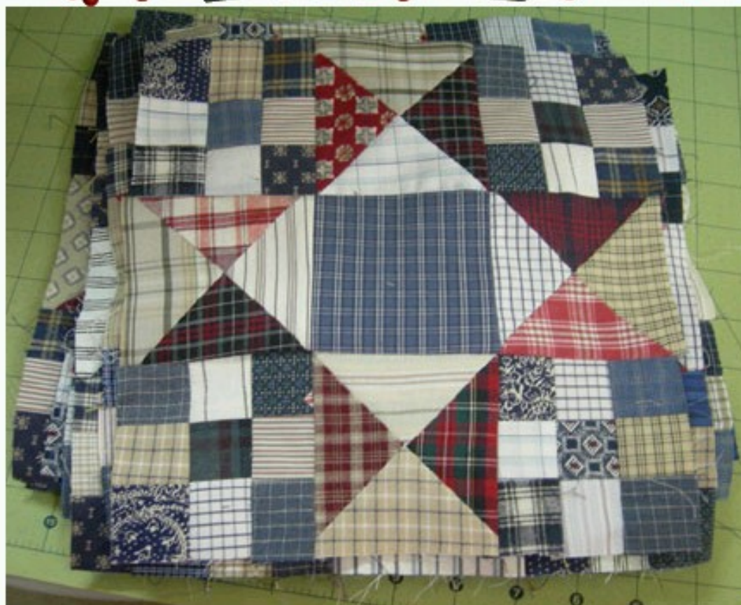
And So It Comes Together! Block 1!