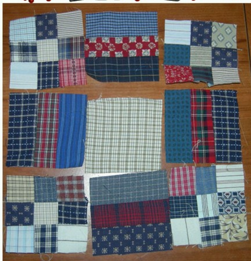
The last remaining block!

How many of you guessed this was the way these went? :c) Ok, so some things, even if predictable, turn out great! You should have 100 rail fence units, 100 9 patches with the accent in the corner, and 25 light squares set aside to make these blocks. You need 25 of them! Ready? Get set! SEW!