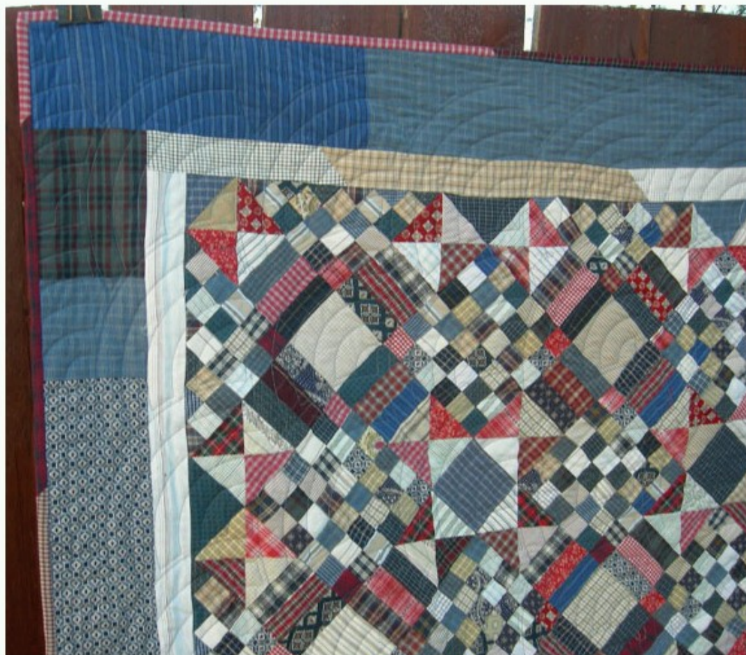
Close-up of fan quilting!

The borders are strictly up to you. You might not even want borders, and that's okay..it's your quilt!