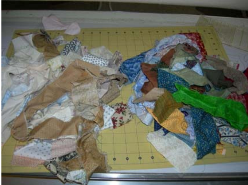
Here is a sampling of the strips I intend to use!