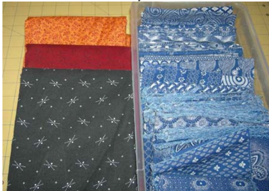
Here are my choices!

In addition to the scraps above....here is a chance for you to get into some yardage that you haven't found a use for yet! Because this is a scrappy quilt for the most part, the yardage fabrics I have chosen for my own quilt are more in the "tone on tone" variety so that the design will really show up when I put the blocks and units together. Feel free to copy my color scheme if you are unsure of what to do. Busy fabrics will give the quilt a different look. For this reason, I am thinking tone-on-tone (think Jinny Beyer Pallet or similar) or even solids.