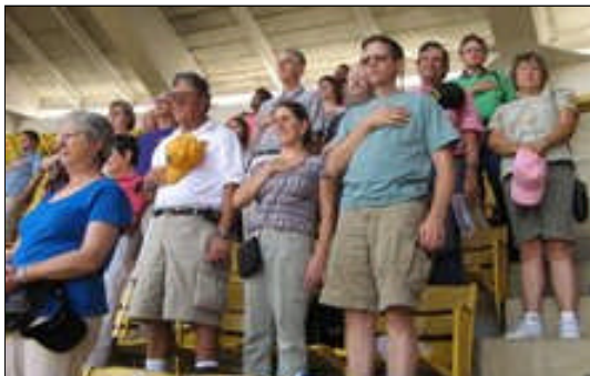
Members and guests stand for the Star Spangled Banner.

Bring the entire family and friends including a fellow veteran to our 22 nd Tour of Duty celebration. Come early and enjoy a great meal and meet your fellow members and their families. You never know who you may meet?