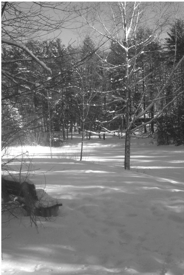
Do you recognize this local view?