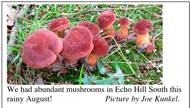
We had abundant mushrooms in Echo Hill South this rainy August!