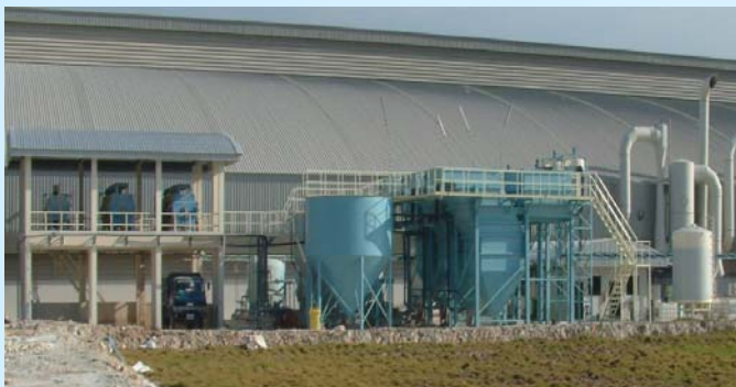
Inclined Plate Clarifier in Ceramic's Wastewater treatment Plant

ENVIRE SYSTEM has a wide range of experience in design, construction ,installation, and operating of this wastewater treatment plant. Whether you desire to treat ,a small package plant or a large regional facility, we have the technical horsepower to help you get the job done on time and within budget.