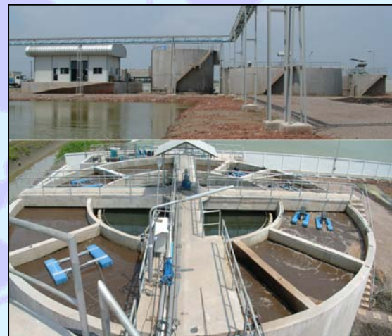
Food Processing Wastewater Treatment Plant