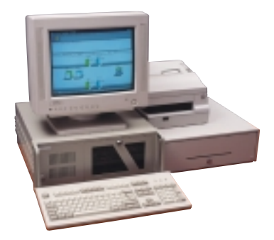
Central cashier with fee computer and validator