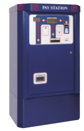
Automatic pay on foot machine