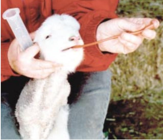
Figures 10. Crimp off the tube as you withdraw it to prevent fluid from entering the lungs.