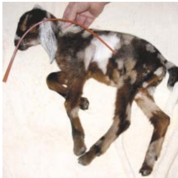
Figures 1 and 2. Feeding tube will be inserted to the depth of the last rib. Note length of remaining tube on baby lamb (top) and kid (bottom).