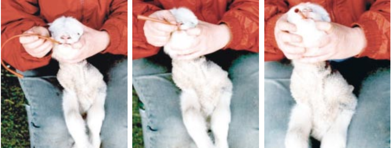
Figures 4–6. Gently advance the stomach tube toward the back of the animal's mouth. The neonate should swallow the tube readily.