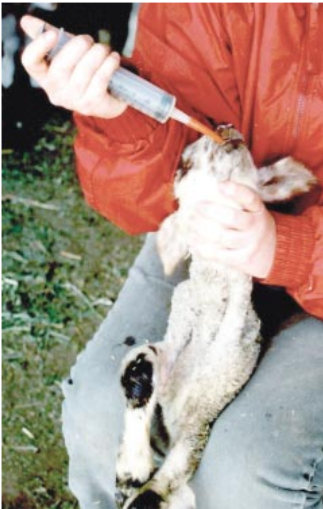
Figure 7. If the stomach tube is placed correctly, there should be strong resistance against the plunger when back pressure is applied.

THE GOAL IS TO INSERT THE TUBE INTO THE ESOPHAGUS, NOT THE TRACHEA. If the tube enters the trachea (windpipe), the animal should cough, gag, and react violently, but a moribund animal may not react. An animal that has swallowed the tube can still bleat and cry; an animal that has inhaled the tube can not make these noises. Actually, it is unusual for the tube to enter the trachea.