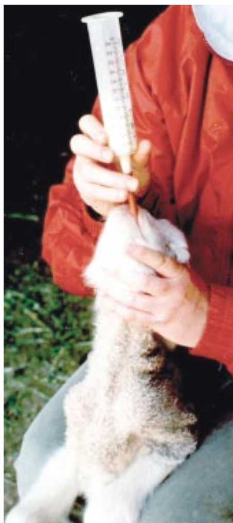
Figure 9. Let the fluid trickle into the neonate's stomach via gravity.

syringe with the warmed fluid (Figure 8). Let the fluid trickle in via gravity (Figure 9). Do not force it with the plunger, as the pressure could rupture the stomach or cause fluid to enter the lungs. Thick colostrum may not flow freely; it may need to be diluted with thinner colostrum. Try to keep air from entering the tube and stomach.