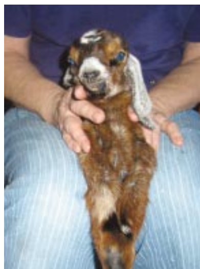
Figure 3. Restrain the animal by holding it gently by the shoulders between your knees facing away from you.