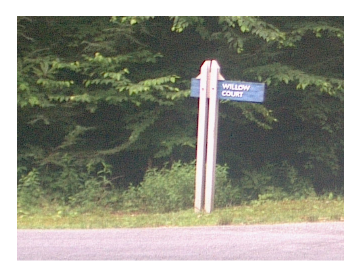
Turn Left on WILLOW CT