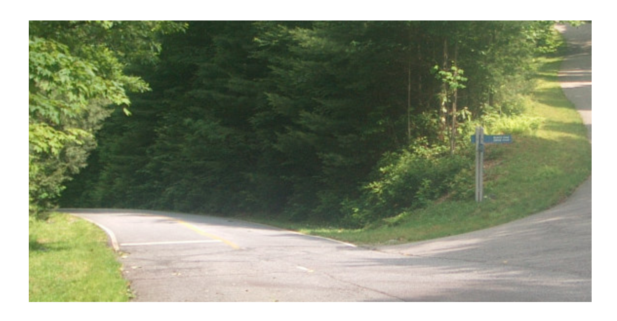
Turn Left on HICKORY DR. There will be a fork in the road after a couple of tenths of a mile. Stay to the left and go another couple of tenths of a mile (0.4 mi total, very wind-y and curve-y)