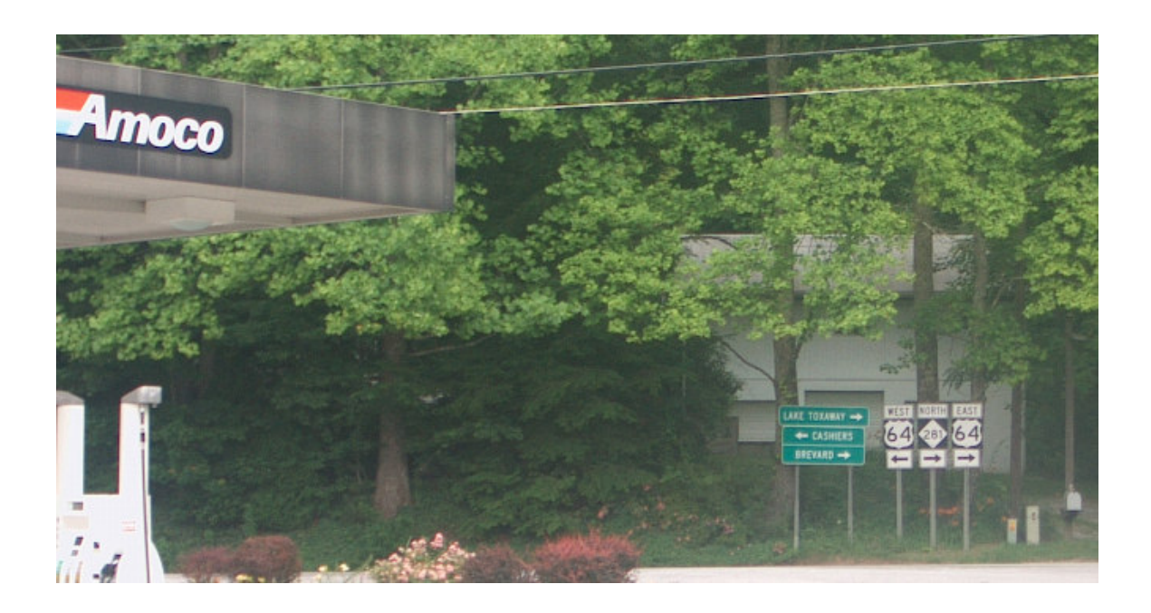
Turn Left on US-64 - go 3.0 +/- mi.

On NC-281 when you go by Gorges State Park you're getting close. There will be a gas station/convenience store at the corner. This is the closest store to our house.