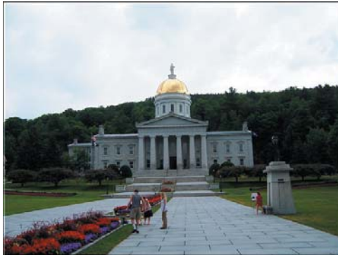
Vermont Capitol in Montpelier