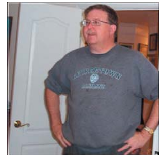
The expression on Chuck’s face when he first saw the headboard

Denise then adhered the tiles to the door, and they glued ropes of cord around each tile. The small tile,