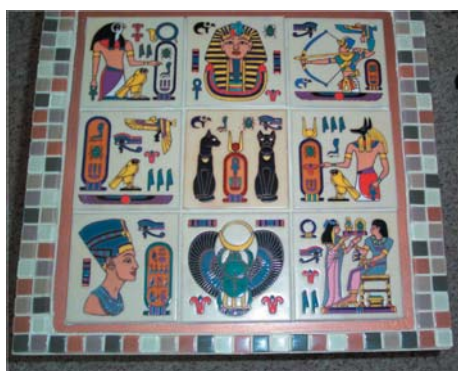
Closeup of the tiles

“It looked very cool,” she says. “When I placed one of the tiles on top of the table, the colors of the tile and the copper worked very well together.”