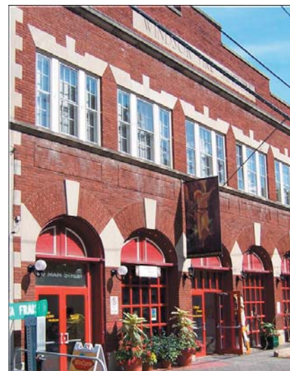
Maxfield Parrish exhibit at the Cornish Colony Museum in Windsor, Vermont

Okay, that puts a different twist on this article. At this point, it's best for