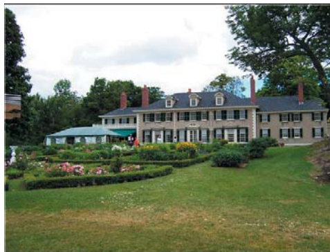
Hildene Mansion, summer home of Robert Todd Lincoln and his family, Manchester, Vermont

Manchester to tour Hildene Mansion, which was built by Abraham Lincoln’s only surviving child, Robert Todd Lincoln.”