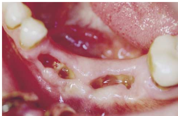
Figure 5. Surgical site six weeks after multiple débridements showing exposed alveolar bone with some evidence of osteonecrosis.

experienced good relief of the systemic bone pain after reinstatement of the drug therapy. Unfortunately, shortly after her last visit to our office, the patient died of metastatic breast carcinoma.