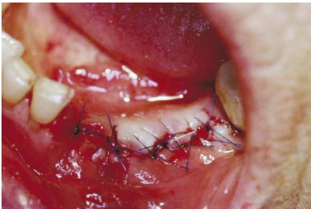
Figure 3. Postsurgical photograph after débridement of necrosed soft and hard tissue in the extraction site areas of teeth nos. 20, 21 and 22, along with the extraction site of tooth no. 23.

nos. 20, 21 and 22 and facial bone loss associated with tooth no. 20. Two weeks after extraction of teeth nos. 21 and 22, her previous oral surgeon documented that the patient had delayed healing of all three extraction sites and exhibited exposed necrotic bone in the extraction sites. The patient was re-examined three weeks later, with no improvement in her condition.