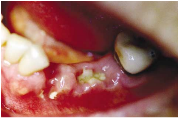
Figure 1. Clinical photograph of the nonhealing extraction sites of teeth nos. 20, 21 and 22 five months after their removal showing necrosis of the alveolar bone and surrounding tissue.