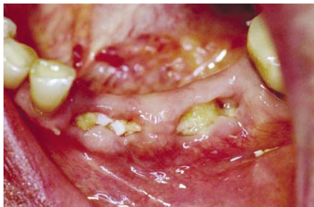
Figure 4A. Surgical site two weeks after local débridement and extraction of tooth no. 23.

area of the extraction sites. He found no evidence of bone deposition or trabecular pattern within the extraction sockets despite the length of time since the extractions had been performed (Figure 2).