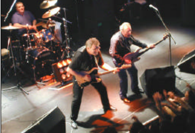
Frightening the locals. The Bottom Line, Nagoya.