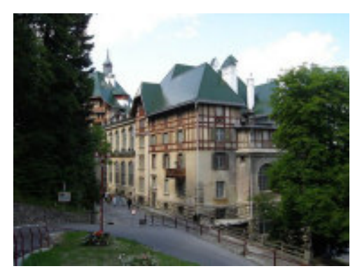
Pictured: Südbahnhotel Semmering

Among numerous festivals held all over Austria*, is the "Festspiele Reichenau" a topranking theatre festival among the