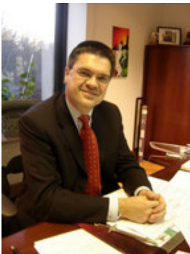
Consul General Gernot Wiedner

The Consular Section of the Embassy in Washington covers a surprisingly large area of the United States, including 15 states South of Washington, D.C. with a total population of 115 million people. It is estimated that this number includes approximately 30,000 Austrians living there. There is a total of 10 Honorary Consulates in this area that mainly