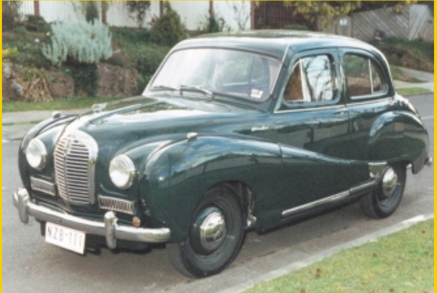
1954 Austin A40 "Best Presented Vehicle Prize"